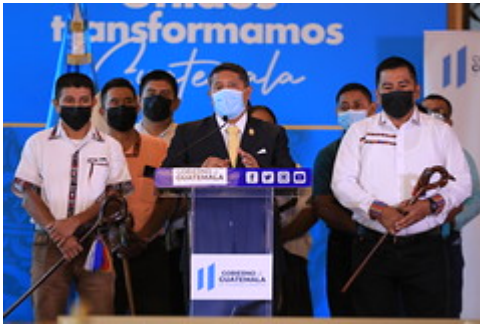
Conferencia de Prensa Semanal 20211213 by Gobierno de Guatemala uploaded on 13 Dec 2021