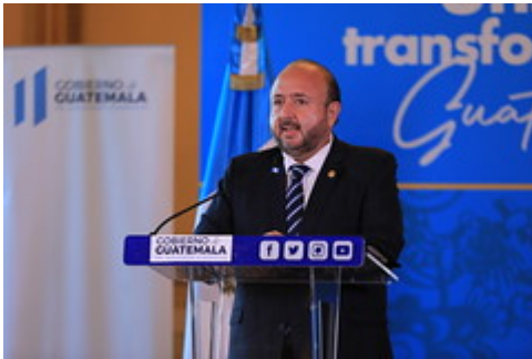
Conferencia de Prensa Semanala 20211213 by Gobierno de Guatemala uploaded on 13 Dec 2021