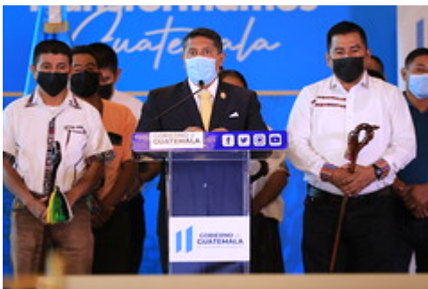
Conferencia de Prensa Semanal 20211213 by Gobierno de Guatemala uploaded on 13 Dec 2021