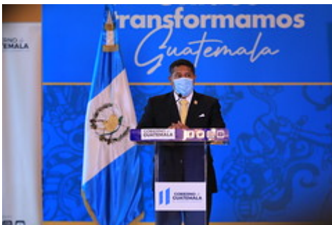
Conferencia de Prensa Semanala 20211213 by Gobierno de Guatemala uploaded on 13 Dec 2021