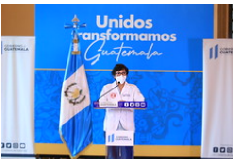
Conferencia de Prensa Semanala 20211213 by Gobierno de Guatemala uploaded on 13 Dec 2021