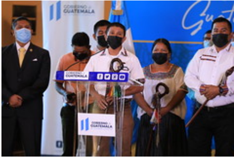
Conferencia de Prensa Semanala 20211213 by Gobierno de Guatemala uploaded on 13 Dec 2021