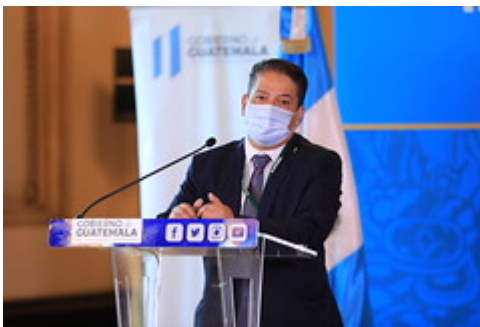
Conferencia de Prensa Semanala 20211213 by Gobierno de Guatemala uploaded on 13 Dec 2021