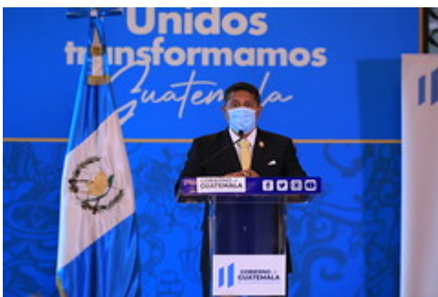
Conferencia de Prensa Semanala 20211213 by Gobierno de Guatemala uploaded on 13 Dec 2021