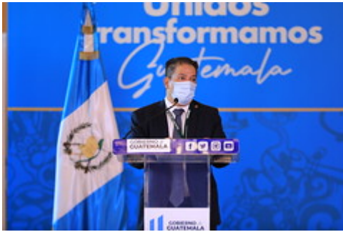
Conferencia de Prensa Semanala 20211213 by Gobierno de Guatemala uploaded on 13 Dec 2021