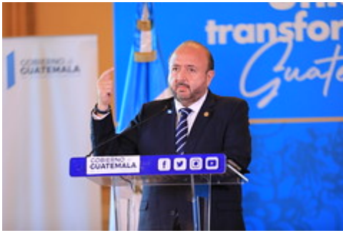
Conferencia de Prensa Semanala 20211213 by Gobierno de Guatemala uploaded on 13 Dec 2021