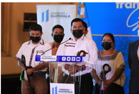
Conferencia de Prensa Semanal 20211213 by Gobierno de Guatemala uploaded on 13 Dec 2021